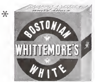
• This sensational new White gives no even newshoe whiteness that does not flake or rub off. In three generous containers—bottle, jar or tube.

THE STARS' SHOES Paulette was thoroughly a kid having a good time.